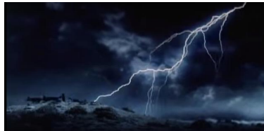
Figure 2. The birth of Atatürk

In that scene, the weasels stood for the defenders of the monarchy and imperialism; the grave of the child stood for Turkish society under the yoke of monarchy, and the stroke of lightning indicated the birth of Atatürk ( see Image 2). It was a stormy, dark and scary night until a stroke of lightning brightens the scene. With the successful harmony of audio-visual effects, as well as the accompanying verbal narration, the film calls attention to Atatürk as a pioneer and liberator of Turkish society.