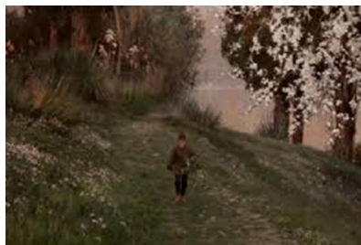
Figure 6. The child (who stands for Atatürk), who 'came up' from the 'Four Seasons'

At the final scene, as mentioned before, the film comes back to the opening scene. The child (who stands for Atatürk), who 'came up' from the 'Four Seasons' (the oil painting in his room) was shown again but this time getting deep inside the scene and dissolving it to declare his death (see Image 6). Students of the military school were singing "March of the Youth" in the background while bidding farewell to him. Then, the final track, 'Cenk', plays in the background, and its lyrics again in a final scene highlighting his inner world, his emotions and the difficulties that he had faced. The soundtrack also tells audiences that feelings about being an 'orphan', 'homeless', 'dispirited', 'insufficient' or 'alone', can lead to other possibilities.