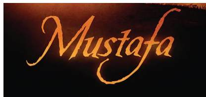
Figure 1. The title of the film

The movie starts with the sound of sea waves accompanies the verbal narration. It then transitions to the only room where there are lights on, which is the one where he is at his death bed. It starts with an extreme wide shot and then closes in on the room with a medium shot. The narration about Atatürk's childhood then begins with an extreme close up focusing on the oil painting 'Four Seasons'. After a bit more focusing, a child appears as a distant memory deep inside of the painting and comes toward the spectator. In the meantime, the verbal narration transitions from his existing situation (being on the death bed) to the beginning of his life story, grabbing the attention of the spectator. The reason for using the oil painting instead of a photograph was to try to link his life and what he had left behind to the aesthetic of a work of art. In addition to this, the reason for shooting a sunset in almost every scene as a background and for using the sunset as the font color for the title of the film was to emphasize the idea of the "Sunset of a nation" (see Image 1). During the film, the sun was mostly used as a metaphor for Atatürk as a political leader and sometimes as an indicator of change in a negative sense.