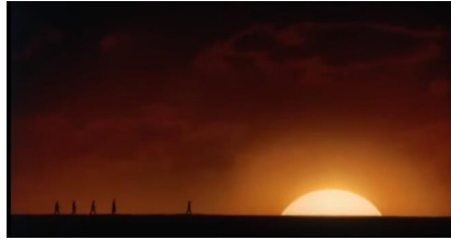
Figure 5. The first moments of the new formation of Turkey (Birth of a Nation)

To consolidate a sense of reality affluently, the film showed Atatürk's photos and old videos. Apart from the last few scenes, only the hands of the actor who portrayed Atatürk were shown. This was done so as to claim the significance of Mustafa Kemal Atatürk for the establishment of the Turkish Republic. In the first scenes, which were full shots, he was portrayed writing or thinking or in a room full of books to emphasize the importance he gave to education.