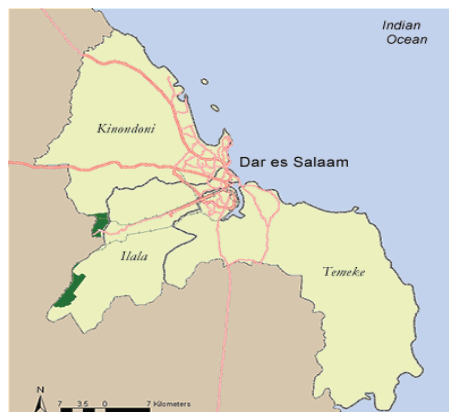
Figure.1. Dar es Salaam showing the city municipalities

Kinondoni is the largest municipality of the three municipalities in Dar es Salaam City. Others being Ilala and Temeke (see figure 1). The whole of Kinondoni municipality effectively encompasses an area of 531 km 2 , and a population of 1,083,913 according to national census of 2002 and estimates for 2007 was around 1,3337,875 2 . The population density is estimated at 2,825 persons per square kilometre. The municipality is administratively divided into twenty seven (27) wards, which in turn are sub-divided into villages for rural areas and sub-wards commonly known as Mtaa 3 (singular) or Mitaa(plural) in the urban areas.