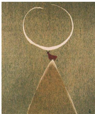
робелен «Mountain of the world - II», 183x163 см., 2007 г.

This brings to mind the distant half-forgotten details that in Tengrian culture ox -like creature with a cold breath, always personified the night, which means friendly and correlated with nocturnal luminary - moon. And again, through a combination of minimal elements artists create for himself and for the audience creative image of time - bull on top of the mountain with the moon on the horns - a torch, universal beacon, illuminating the whole sublunary world. That's right, a representative of domestic cattle, by the will of the artist receives new figurative birth, appears in a crucial status in its original, archetypal form.