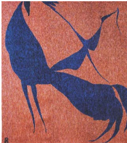
гобелен «Flagman», 180x156 см., 2010 г.

On the whole format of the vertical rectangle woven fabric figure of the rider. The stylized image of a standard bearer on horseback great elegance silhouette creative solutions found. He holds the flagstaff, which leads diagonally up over the edge of the composition itself cloth flag. Also, if is not placed within the picture plane, the head and tail of a horse go over the edge of the tapestry. This artistic technique makroeffekta when the author of the work the viewer closer to the image artificially achieved momentary etched. As if the standard-bearer inspired us with his presence, the next moment has to go to another, it is known to the measurement in order to continue its mission.