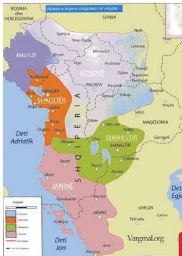
Map of Albanian vilajets 5