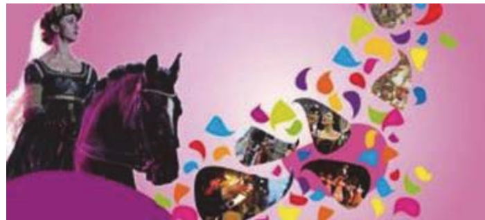
Figure 7: Image of 7 th edition of Roman Carnival 2015 dedicated to Christina, Queen of Sweden

It's claimed that, the pop culture serves the same kinds of social functions as did the medieval carnivals, by Mikhail Bakhtin (Danesi, 2008: 59). Carnival is a ceremony which has no distinction between audience and carnival performers. Everyone is an active participant in the carnival (Bakhtin, 2001: 238). Today the tradition of Carnival seems to continue by modern ways in many countries of world (Rio de Janerio, Venice, Munich etc. )