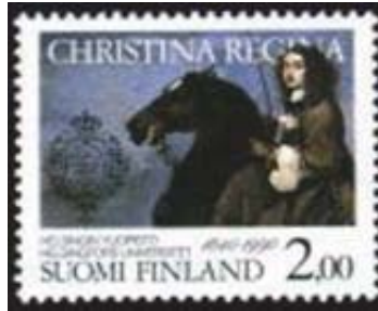
Figure 6: A commemorative stamp for the 350th Anniversary of the University of Helsinki