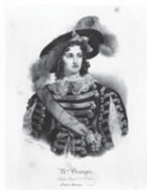
Figure 2: Mademoiselle George in the role of Queen Christina