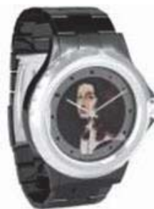
Figure 8: Woman Watch with Queen Christina's Portrait (that was made by Sébastien Bourdon 4 )

Today, famous works of art not only stay in museums but also take part in our everyday life as accesories. These works of art are used as a part of popular culture. Queen Christina, as an important historical figure, is also used with her portrait on many accesories like watches (See: Fig-8) and brooches (See: Fig-9)