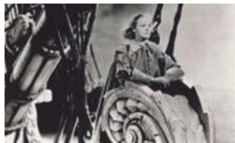
Figure 11: A Scene from "Queen Christina"- Greta Garbo as Queen Christina