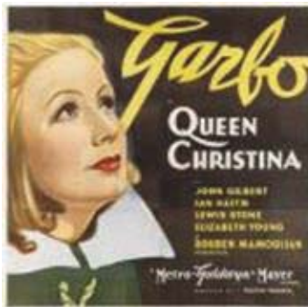
Figure 10: "Queen Christina"-Movie Poster-1933

Popular culture affects film industry. Tracer events and figures of world history are preferred as the subject of films. There are many films which based on; wars, leaders, scientists, politicians, victories etc.