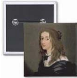
Figure 9: A Brooche with Queen Christina's Portrait (that was made by Sébastien Bourdon)

Queen Christina as a famous historical figure inspired many writers. So there is an extensive literature of books which were written about Queen Christina. Some of these can be listed as follows: "Queen Christina of Sweden" (Hardinge, 1880), "Queen Christina" (Masson, 1974), "Outrageous Queen: Biography of Christina of Sweden" (Cartland, 1974), "Christina Queen of Sweden: The Restless Life of a European Eccentric" (Buckley, 2005), "Kristina: The Girl King, Sweden, 1638 (The Royal Diaries)" (Meyer, 2003), "Queen Christina of Sweden (Queens and Princesses)" (Mattern, 2009).