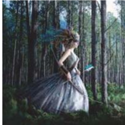
Figure 4: "Christina of Sweden-The Androgynous Queen" by Alexia Sinclair

"Christina of Sweden-The Androgynous Queen" (See: Fig-4) is a part of "The Regal Twelve" series. According to photo, Christina is huntress and protectress. She wears a mask which represents other faces or realities and alludes to Christina's cross gender through the two faces of one Queen ( https://alexiasinclair.com/collections/the-regal-twelve#christina-of-sweden-description ).