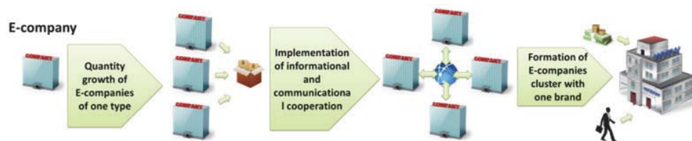
Figure 1: Scheme of the process of E-companies clustering

In the previous part of this article, the readers' attention was focused at the assumption that a cluster may facilitate progressive development of certain companies and of a sector of informational and communicational technologies in general. In this section, we shall try to present our approach to consideration of the clustering in the Internet. Based on the research of the most successful examples of the formation of online enterprises unions, we were able to build a model which shows how the concentration of internet companies transforms into a cluster, and the cluster, in its turn, causes a positive flow of general development of the sector (Figure 1).