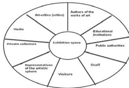
Figure 2. Public group art project, where are various kinds of communication