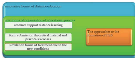
Figure 1 – The main elements of the concept of innovation format of the system of correspondence education in modern conditions of the higher education system's virtualization.

In the conceptual aspect the innovative format of the system of distance education in modern conditions of the higher education system's virtualization contains a number of basic elements, see figure 1.