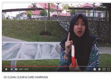
Figure 2: Learners Video Project (3C-Clean, Clear and Care Campaign)

From the video activity, I get to learn how to speak confidently, and do research on current issues (B17) Yes, I like the learning experience through research/survey and producing video presentations because I can explore and gain more knowledge about how to make the good video presentations (BS11)